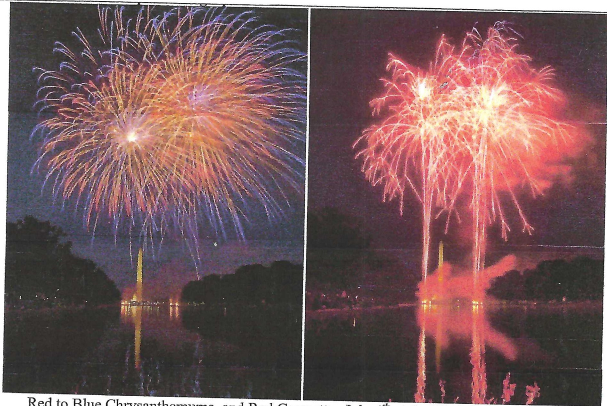
Red to Blue Chrysanthemums and Red Crossettes July 4 th at the Washington Monument

Submitted By: Garden State Fireworks, Inc. The Santore Brothers